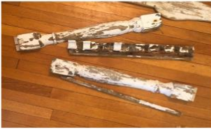
Fallen Ballusters which fell from Clocktower